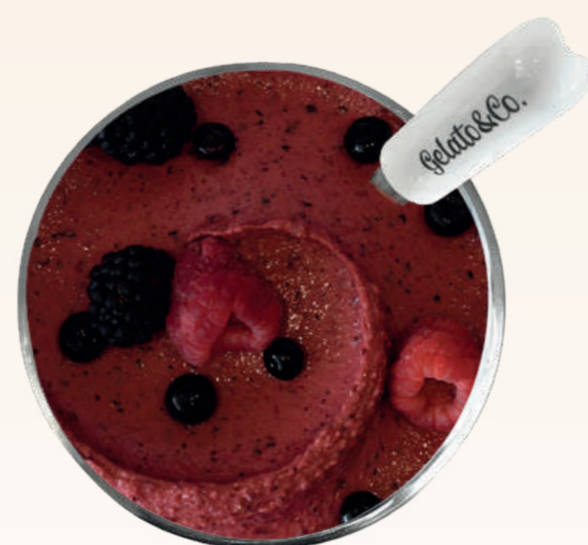
Mixed berries sorbet