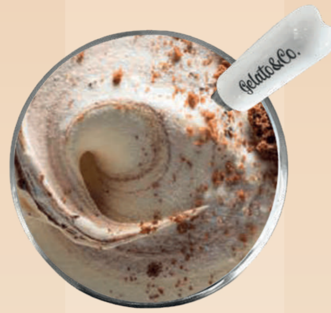
Cookies not cookies&cream