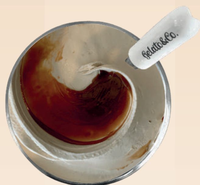
Dulce de leche