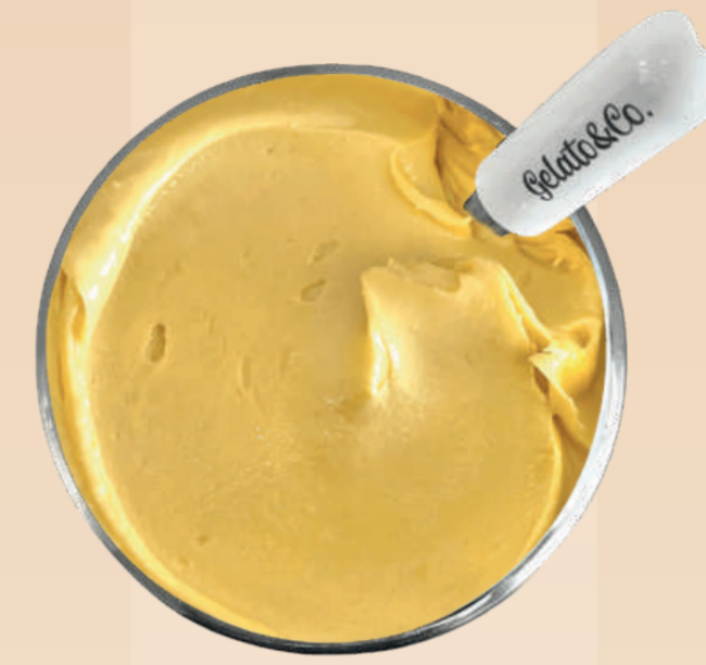
Passion fruit sorbet